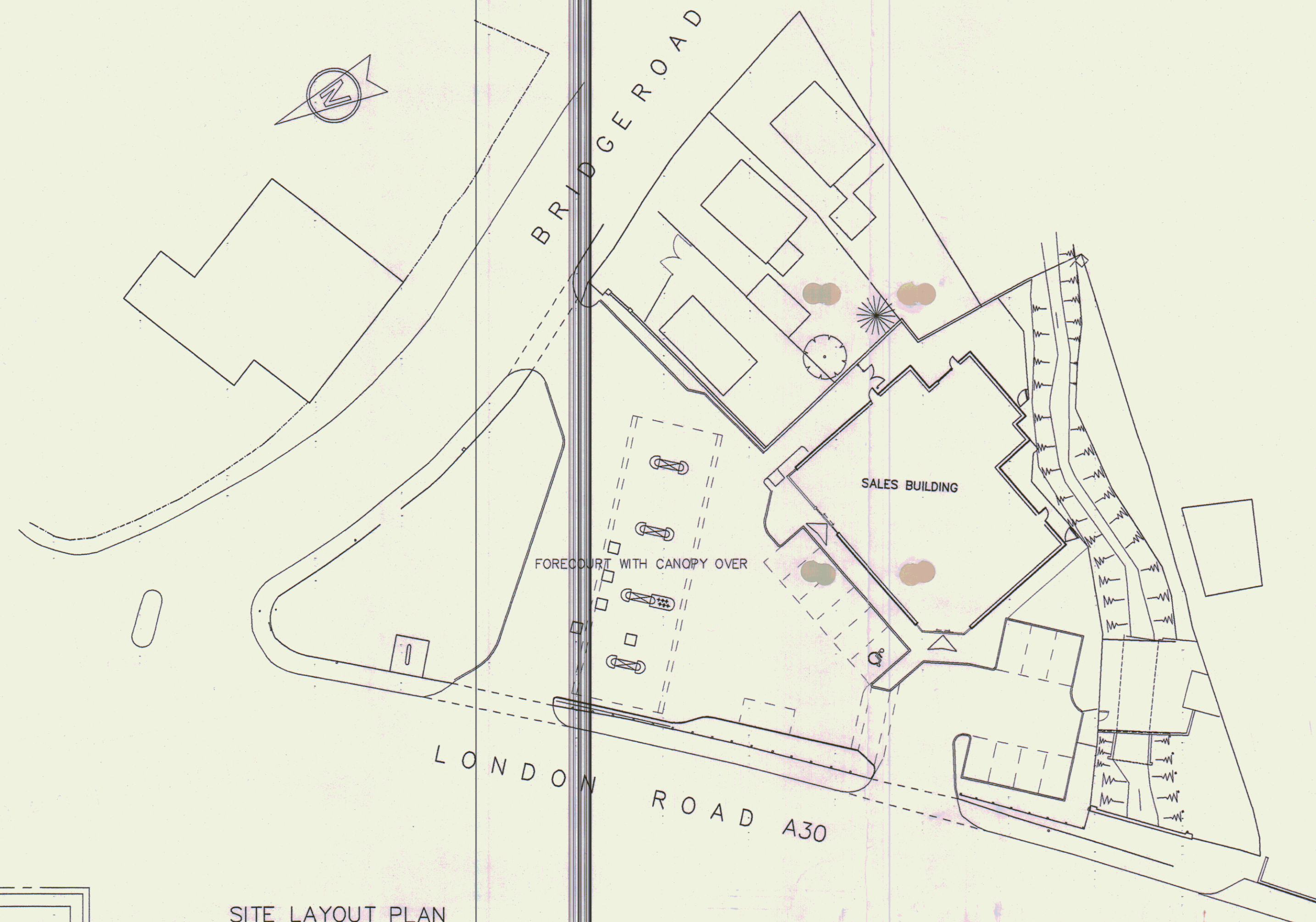
SITE LAYOUT PLAN NTS